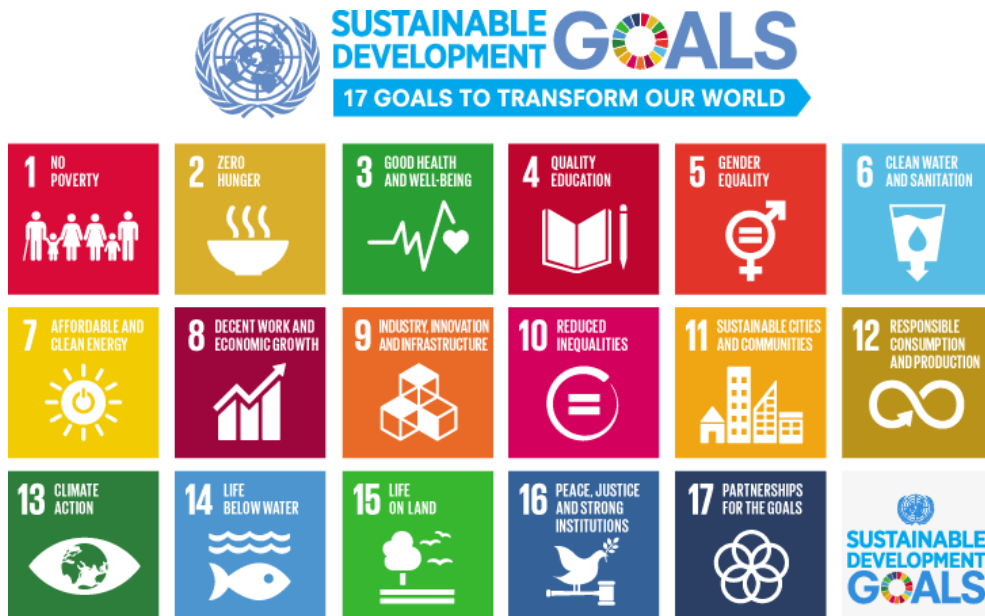
Figure (1): UN Global Goals (SDGs)

The 17 SDGs are integrated—they recognize that action in one area will affect outcomes in others, and that development must balance social, economic, and environmental sustainability.