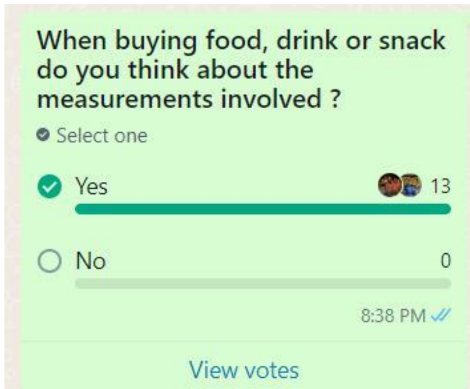
Figure: Image of poll done via WhatsApp